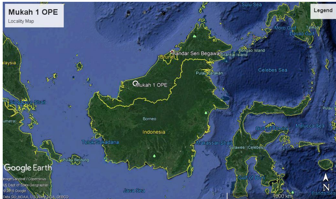
Figure 1: Locations Map